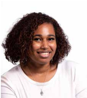
Breanna Palmer Kansas State University